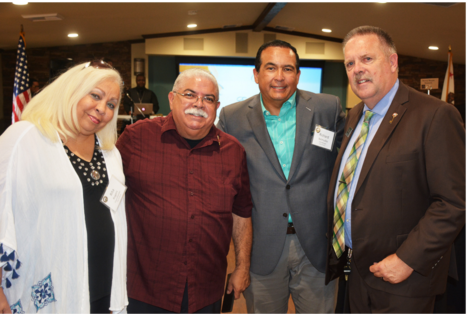
Perris officials inked an agreement this week with Mt. San Jacinto College administrators that paves the way for higher-education classes at the City Senior Center.