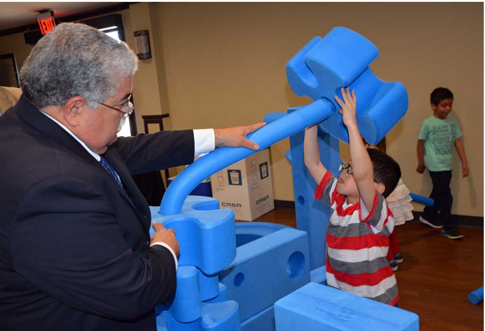
Perris Mayor Michael Vargas lends a hand to a youngster from the City's Boys & Girls Club during a recent construction project using "imagination playground blocks."

Boys and girls at the Boys & Girls of Perris showed off their new play equipment before City elected officials who welcomed the new additions as a way to stimulate young imaginations while benefitting from physical exercise.