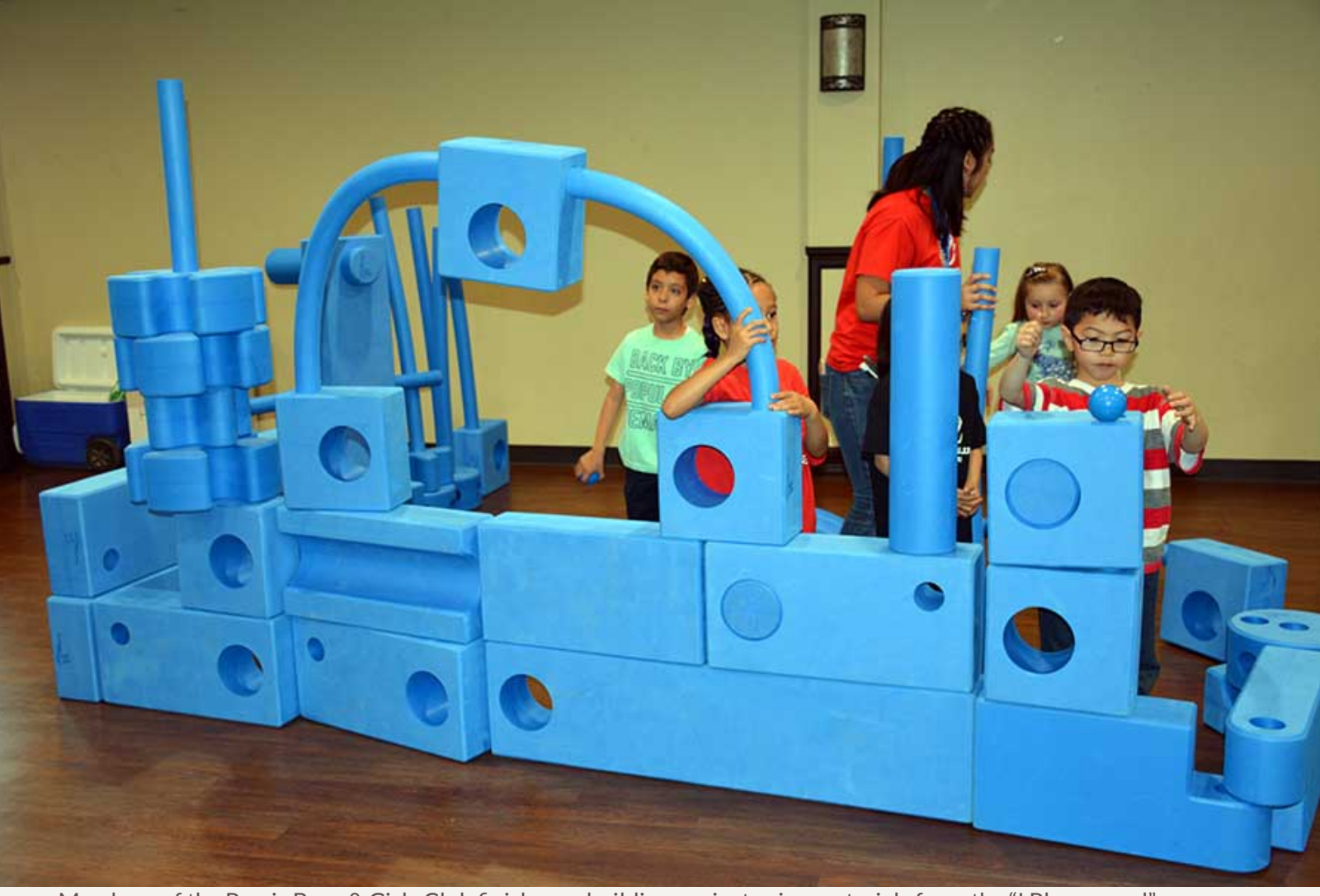
Members of the Perris Boys & Girls Club finish up a building project using materials from the "I Playground" program.

"Our collaboration with the City of Perris is great," she said.