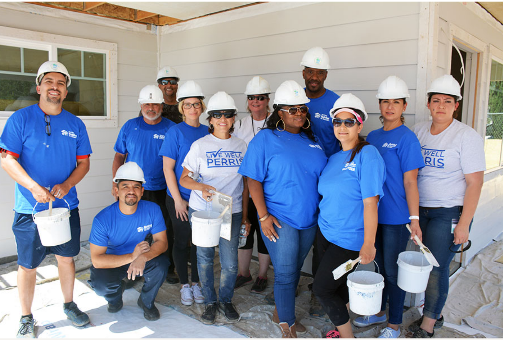
A group of Perris volunteers takes a break from the heat during a painting day at a Habitat for Humanity construction project on South Street.

Perris elected officials and municipal workers from several departments picked up brushes and rollers to paint a pair of houses under construction by Habitat for Humanity, which builds homes for deserving families throughout the U.S.