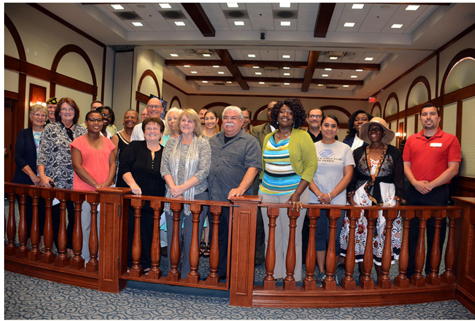
Members of the Perris City Council pose with recipients who received monetary gifts from developer Optimus Building Corporation during a recent City Council meeting.

The City of Perris recognized 13 non-profit and civic groups who received donations from a developer to continue their various activities that preserve Perris history and assist the young, poor, military veterans, mentally and physically challenged, and residents battling addictions.