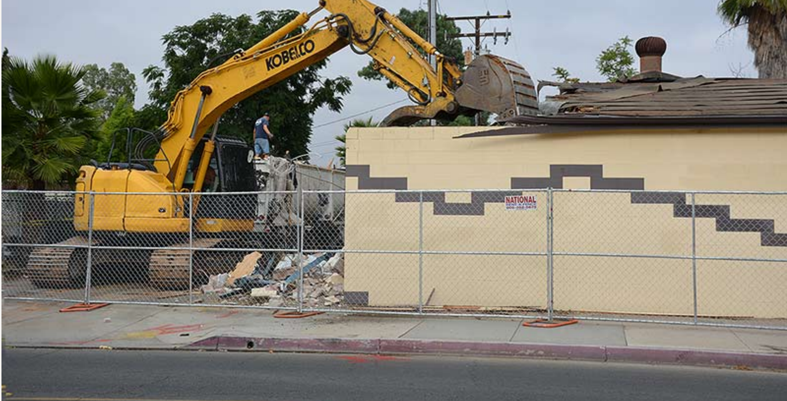
A building known as "The Boulevard" is taken down to make way for a new lane along Perris Boulevard.