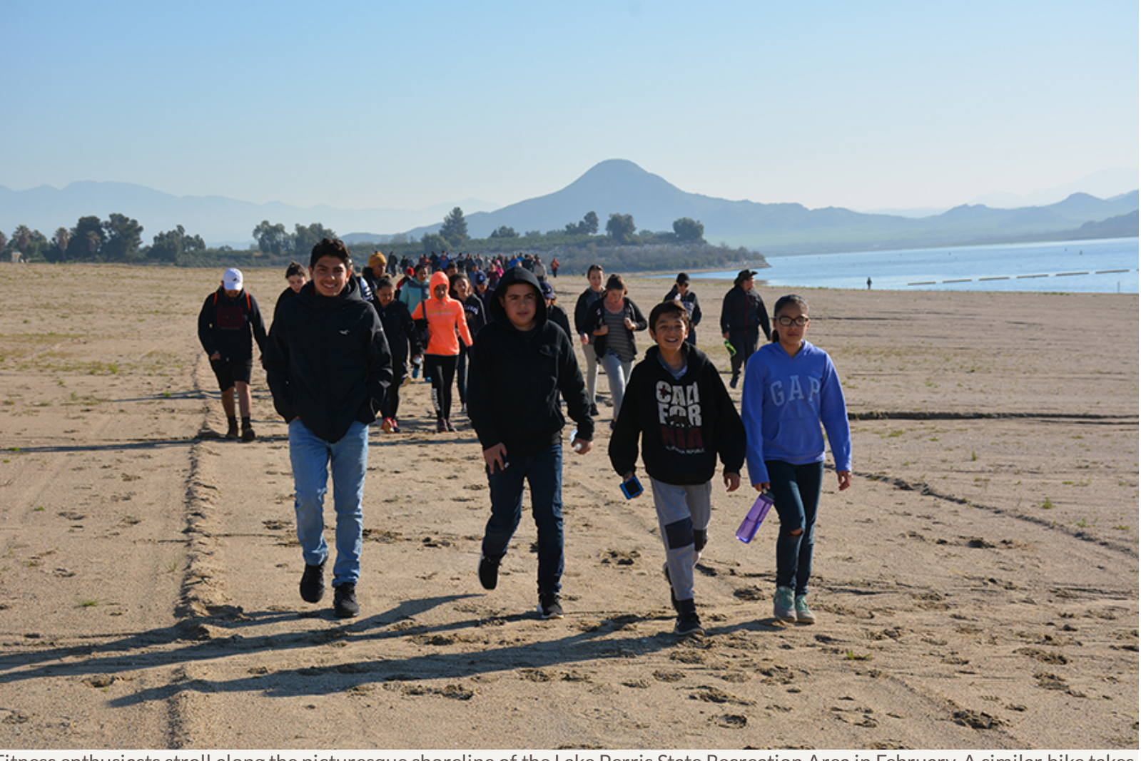
Fitness enthusiasts stroll along the picturesque shoreline of the Lake Perris State Recreation Area in February. A similar hike takes place Oct. 28 at Lake Perris.

The City's final "Take a Hike" for 2017 takes off Oct. 28 from the Lake Perris State Recreation Area.