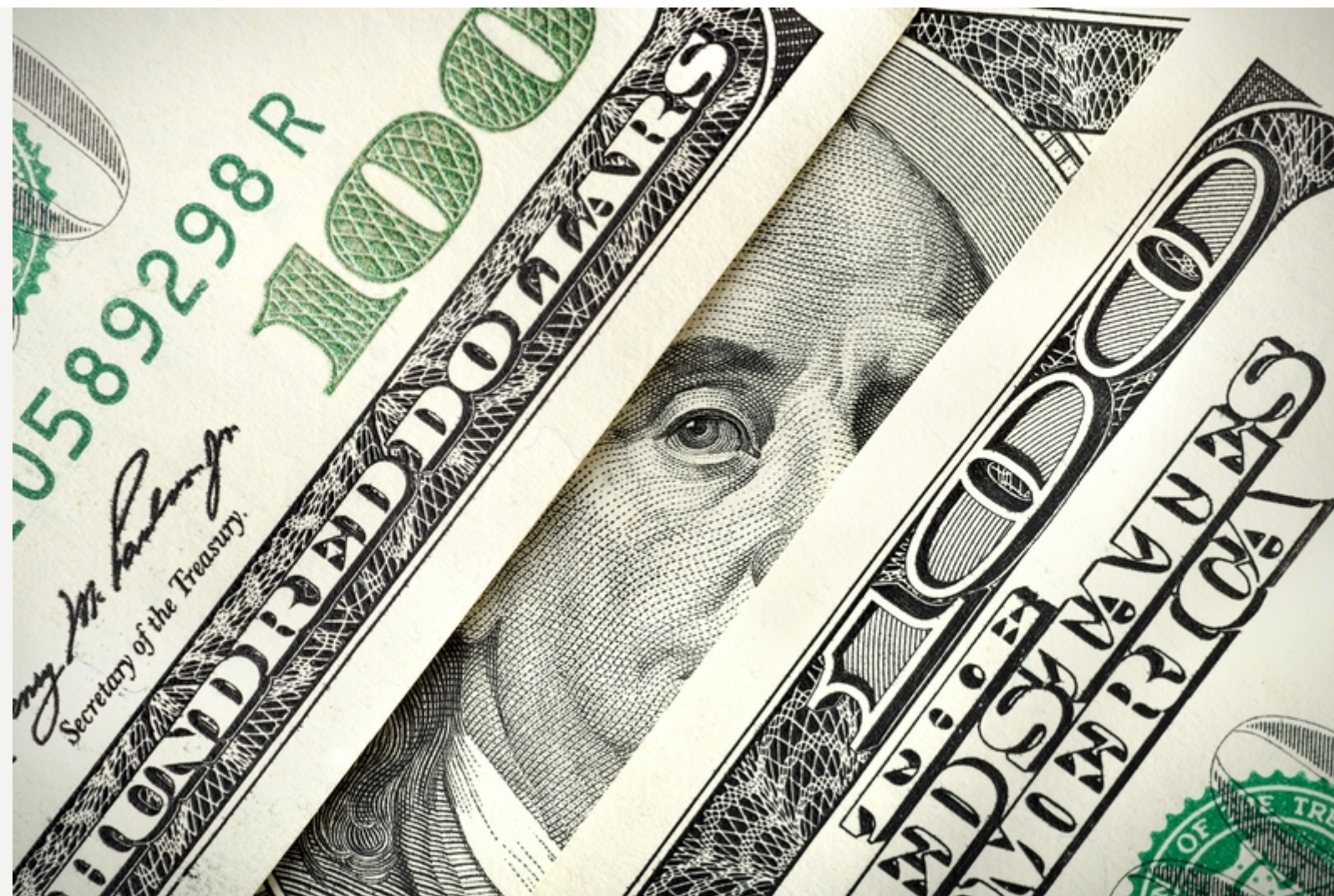
Keep an eye out for tax scams.

More information about phishing or phone scams is available at www.IRS.gov