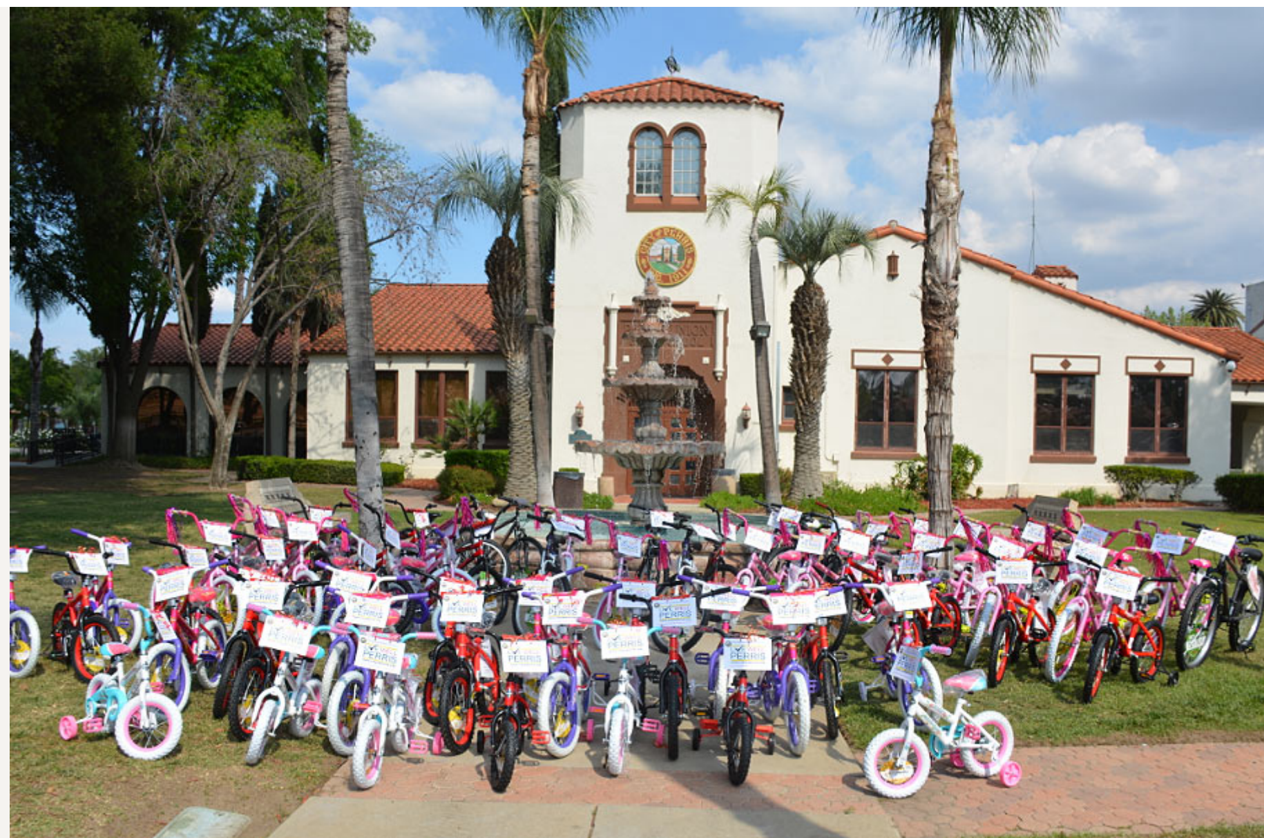
The iconic water fountain at Perris City Hall serves as the backdrop for dozens of bicycles that will be raffled off during the Fourth Annual Health Fair April 23 from 10 a.m. to 2 p.m.

The free fair continues the Live Well Perris healthy eating active living campaign, which has garnered the City national, state and regional accolades.