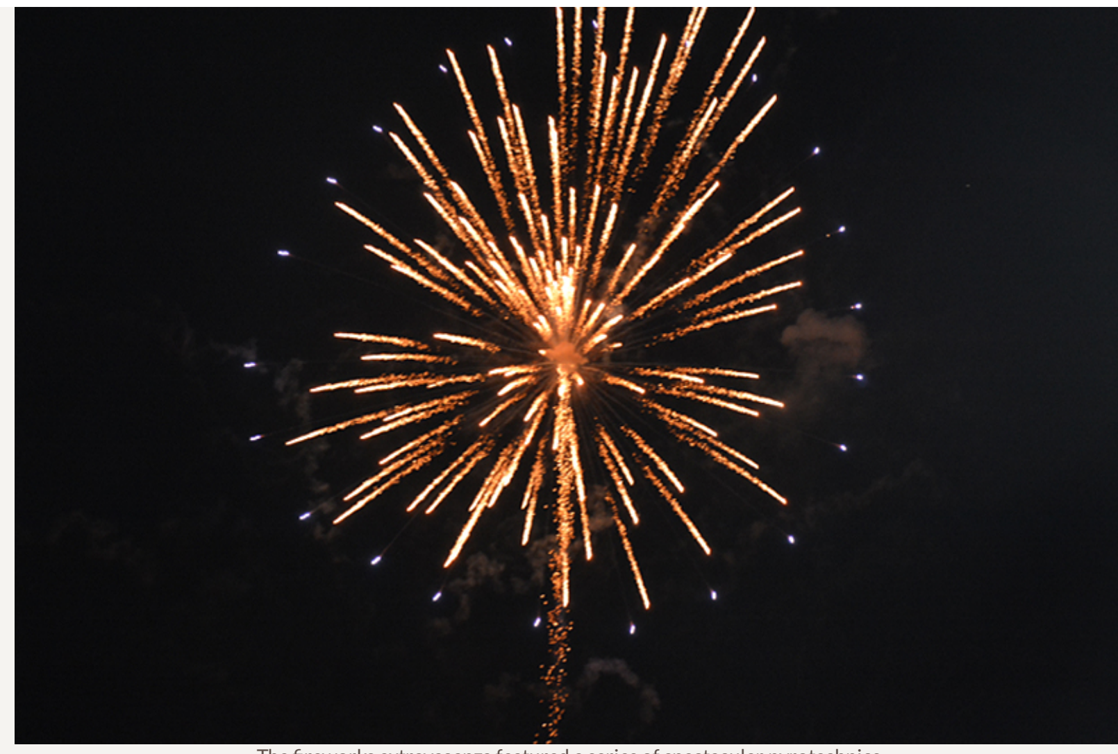
The fireworks extravaganza featured a series of spectacular pyrotechnics.