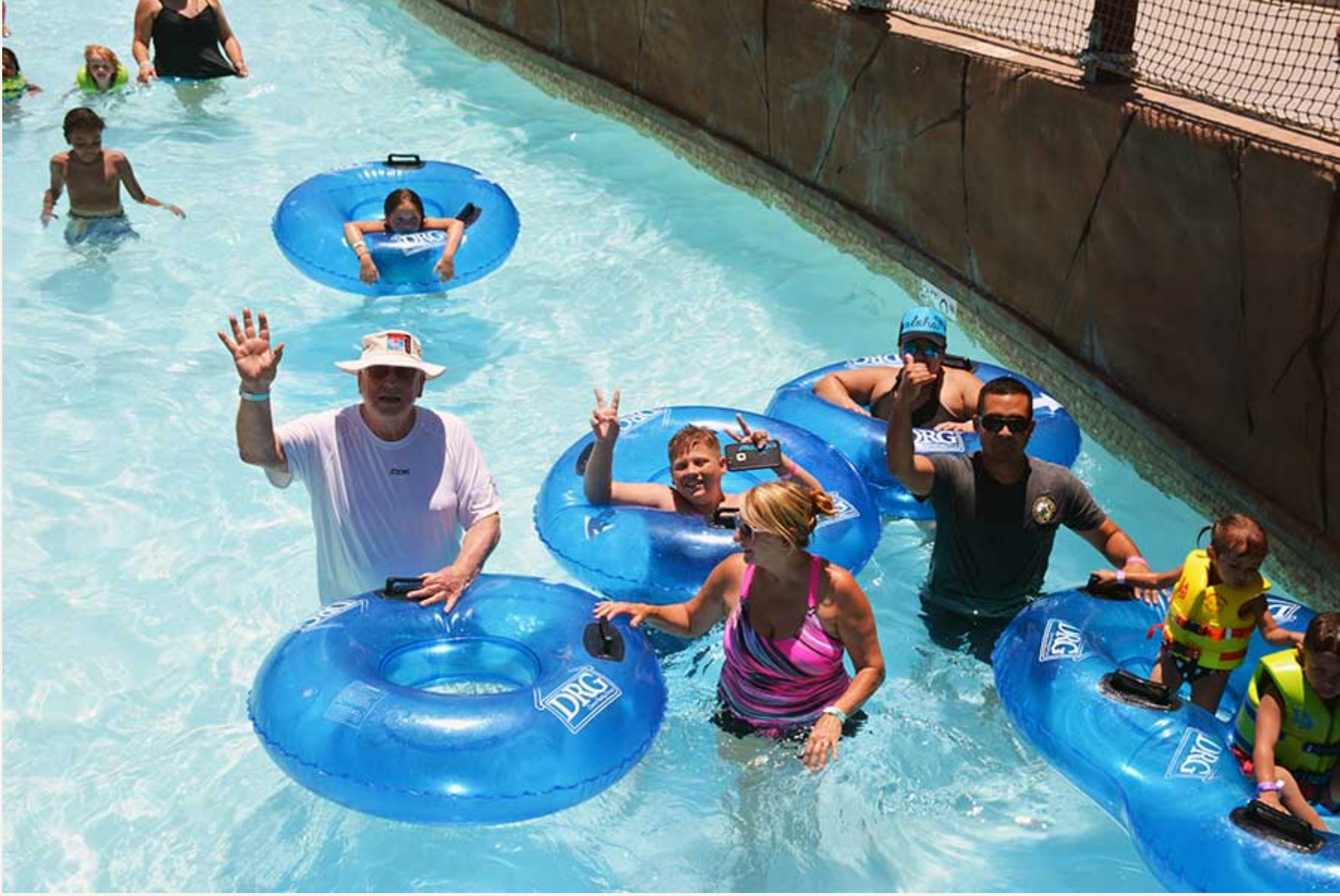
Perris Mayor Daryl Busch waves as he strolls down the Lazy River attraction July 15 at the annual Perris Day at the DropZone Waterpark.

day for residents. The City provided 1,700 passes to Perris residents for the July 15 extravaganza.