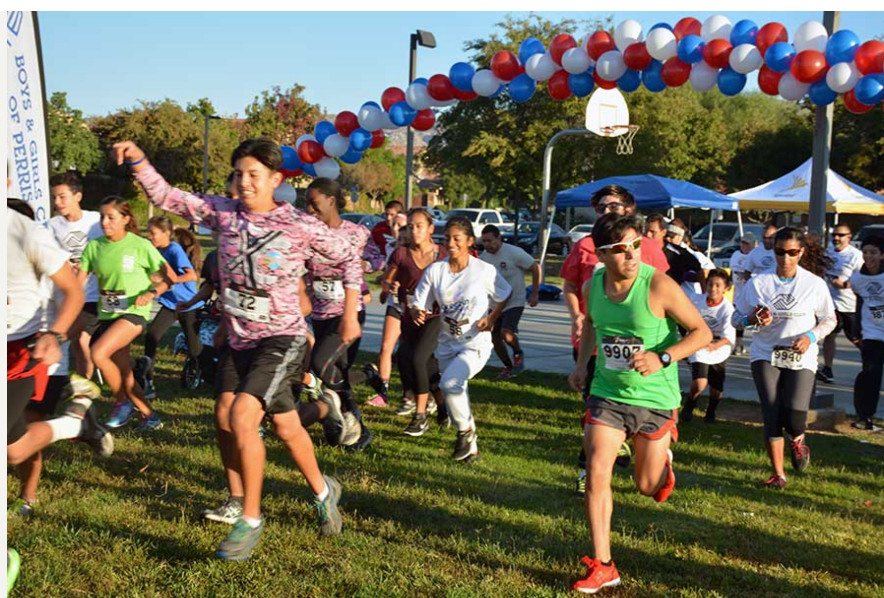
Runners take off at the start of the 5K run Nov. 5 at Frank Eaton Memorial Park in Perris, an event to support the City's Boys & Girls Club.

First came the athletes, the hard-core runners who view the 5-kilometer trek to and from Frank Eaton Memorial Park in North Perris as a mere workout.