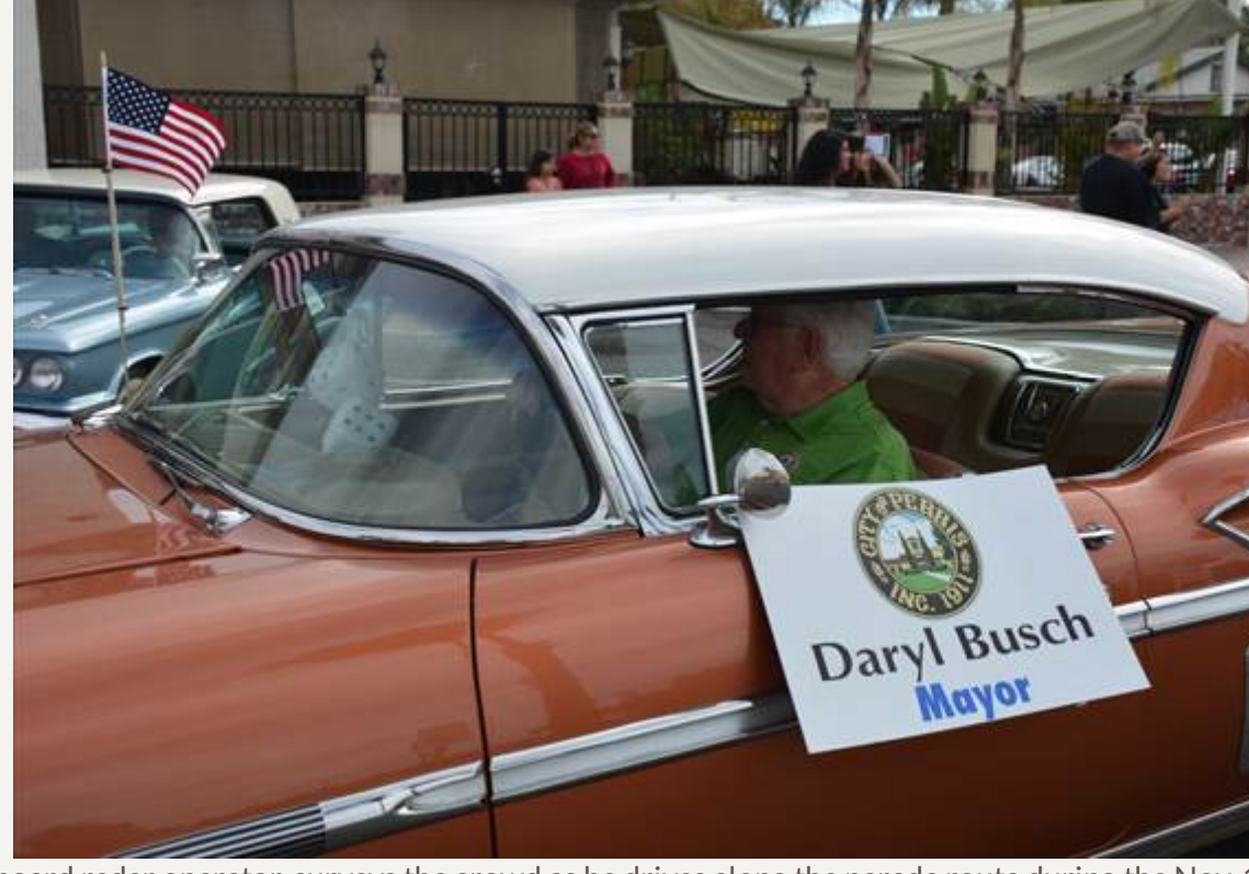
Perris Mayor Daryl Busch, a former Navy shipboard radar operator, surveys the crowd as he drives along the parade route during the Nov. 12 Veterans Day Parade. "A lot of veterans served without fanfare and came home with no special recognition. It's a pleasure to be here on this day to honor and recognize them," he said.

Floats, marching bands, honor and color guards, classic vehicles, the unveiling of a historic mural and a flyover of vintage aircraft highlighted the annual City of Perris' annual Veterans Day Parade Nov. 12. The parade honors the service and sacrifice of the nation's and City's military veterans who have fought in wars all over the world. Perris has more than a century supporting its military and City elected officials highlighted the appearance of dignitaries in the 2016 parade.