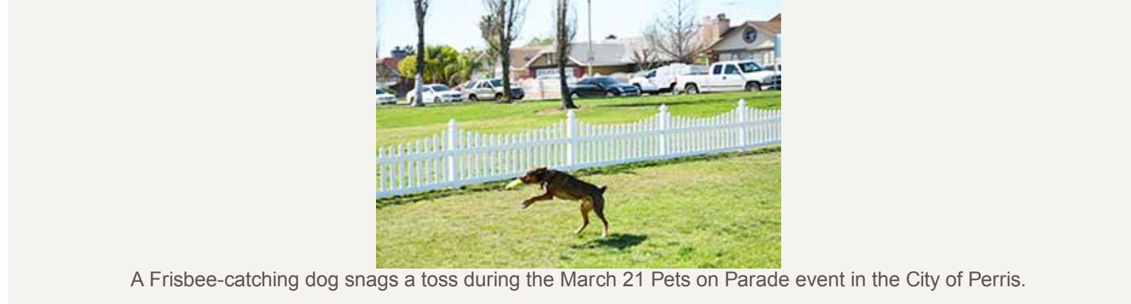
A Frisbee-catching dog snags a toss during the March 21 Pets on Parade event in the City of Perris.

Four-legged friends became the stars of the show March 21 during the City of Perris' second annual "Pets on Parade" at Paragon Park.