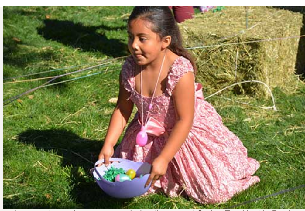
A youngster grabs a treasure during the annual Spring Egg Hunt in Perris.