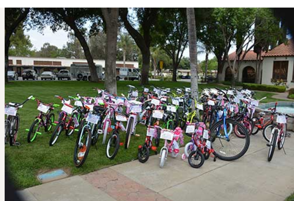
Bicycles purchased for the City of Perris' third annual Health Fair are displayed in front of the City's iconic fountain. The bikes will be raffled off Saturday, April 25.

The City of Perris has purchased more than 60 bicycles to residents who participate in Saturday's (April 25) health fair on the City Hall Campus. The new bicycles, purchased from Wal-Mart in Perris, were paid for by donations from corporate sponsors supporting the third annual health fair, part of the ongoing Live Well Perris Health-Eating Active-Living campaign.