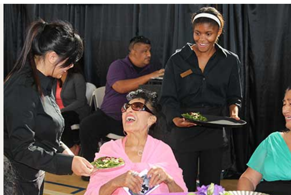
Members of the Perris Youth Advisory Committee serve dinner to seniors during the first-ever Senior Prom in 2014.

Seniors who choose to dress up in 1920s garb will have the chance to don a wide variety of clothing options. Emerging from the drab dress of World War I, fashion designers created women's dresses, pantsuits and hats in a wide variety of colors and fabrics. Women sported canes as fashion accessories and wore jackets lined with fur. Men ditched formal three-piece suits in favor of wide-leg trousers and sport coats. Fedora hats became a rage.